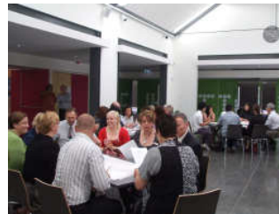
Recent forum where PIE members discuss literacy as one of the barriers to employment for many public housing residents.

The strength of PIE has been the networking, the partnerships formed and the ease with which agencies communicate with one another. It provides a strategic framework for many of the activities targeting Airds, Rosemeadow, Macquarie Fields, Minto and Claymore.