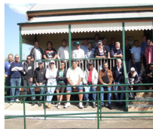
Fair Repairs participants Contact:4620 5310

This initiative targets public housing residents to repair and maintain public housing properties.