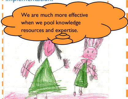
The children of Rosemeadow share what they want to be when they grow up. This six year old wants to be a hairdresser.

Rosemeadow have just completed their Employment plan in November 2009 and are looking forward to the implementation.